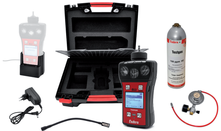
OLLI Tracer Gas in a set