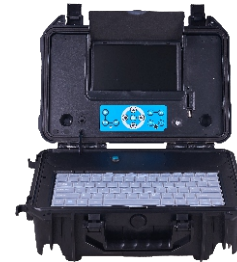
1 × Control Box